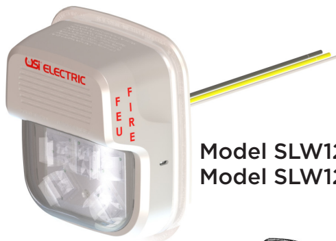
Model SLW127CN | Canada Model SLW127 | USA

Flash Patterns to Distinguish Smoke, Carbon Monoxide or Natural Gas Danger