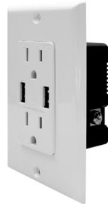
MODEL SHOWN IS USB2R2WH15A36